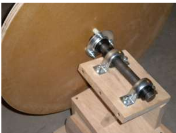
Photo showing the completed assembly from the backside.

This is a close up of a small roller I found laying around that I slid onto the motor shaft and secured with a 14mm collar. The thing I like about it is it has a rough surface and creates a small vibration on the disk. This aids in bouncing your cores in the beginning process and it will make things easier to get them started. I have been searching for where I might have gotten this from, but at this point do not know.